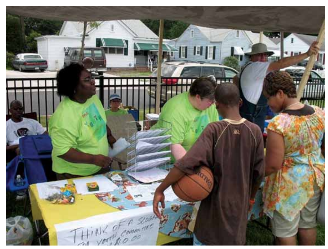
Members of the Fairmount Park Youth Civic League recruit young people during the grand opening of the renovated neighborhood Shoop Park.

tion success is changing. Where past success has been based on outputs, NBN will be based on outcomes measuring whether the neighborhood is improving as a place where neighbors invest, attract new good neighbors, build equity and build neighborly relations.