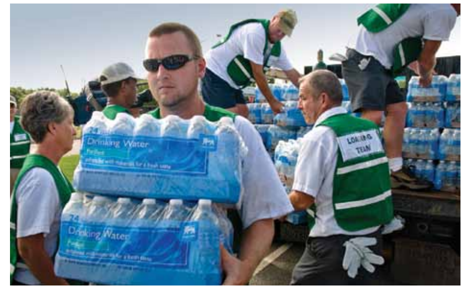
The commodities distribution plan includes 18 sites accross Virginia Beach.

The City of Virginia Beach commodities distribution plan was developed through the leadership of the Department of Public Utilities (DPU), the Department of Health, and many other partners. The first step was DPU's development of a big-picture Emergency Water Supply Plan. DPU engaged the Virginia Beach office of Michael Baker Jr., Inc., an infrastructure consulting firm that has provided on-call engineering services to the city since 1999, to