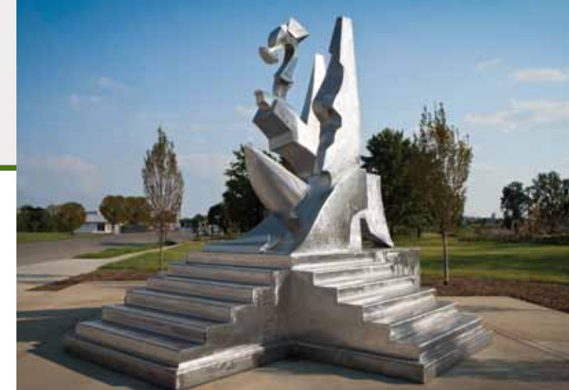
Sculptor Richard Hunt explained his piece Build a Dream this way: "The community is rebuilding, and the sculpture will suggest something being built."

A city or town isn't livable just because it has good jobs and housing, a nice mix of entertainment and recreation. It's also important to feed the spirit; the arts do that.